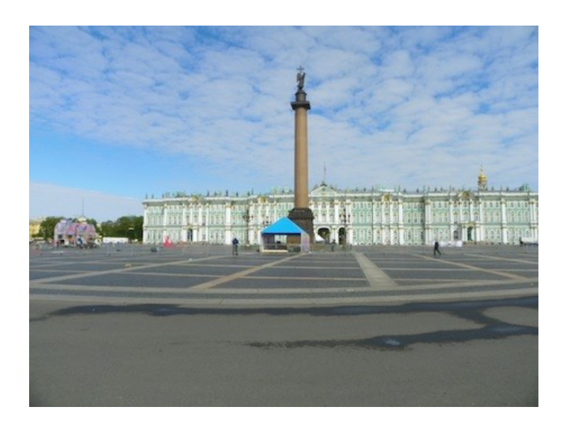
The Hermitage Museum

At 300, St. Petersburg reflected a lot of "Western" traits; from the architectural designs of the buildings to the goods in various retail stores. It was also the "White Night" season, which meant that the city never became dark at all for three weeks. At night, the sky remained bright and it was very difficult to get any sleep. We also visited Alexander Pushkin's archives in a special library; his papers, memoirs and writings were kept there. Rarely do they offer visits to outsiders to view Pushkin's papers. (Alexander Puskin is known as Russia's greatest poet from the 19<sup>th</sup> century).