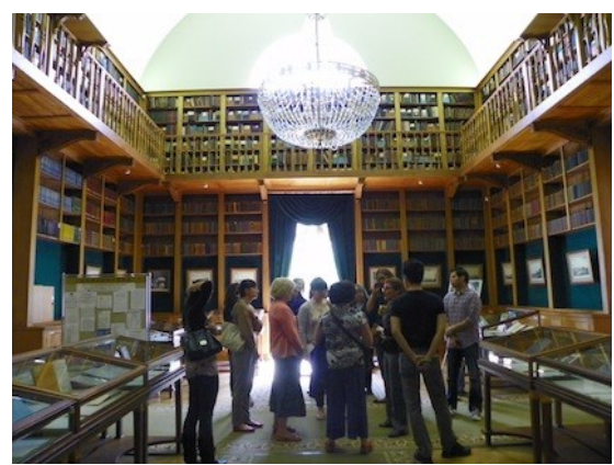
Inside one of Russia's National Libraries

Throughout the city, we visited over 15 different types of libraries in our brief stay: national, public, academic, school libraries and special libraries including a business center and the library in the Hermitage Museum. It was a real treat to see these libraries and learn how they have changed over time in Russia. More importantly, we interacted with library science students and faculty in the St. Petersburg State University of Culture and Arts where we had seminars discussing social media, issues of censorship, books during the Soviet period, and reading cultures of today's youth.